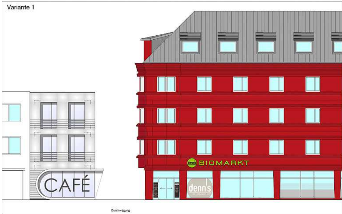
ANSICHT VON DER LIMMERSTRASSE | M:1:100